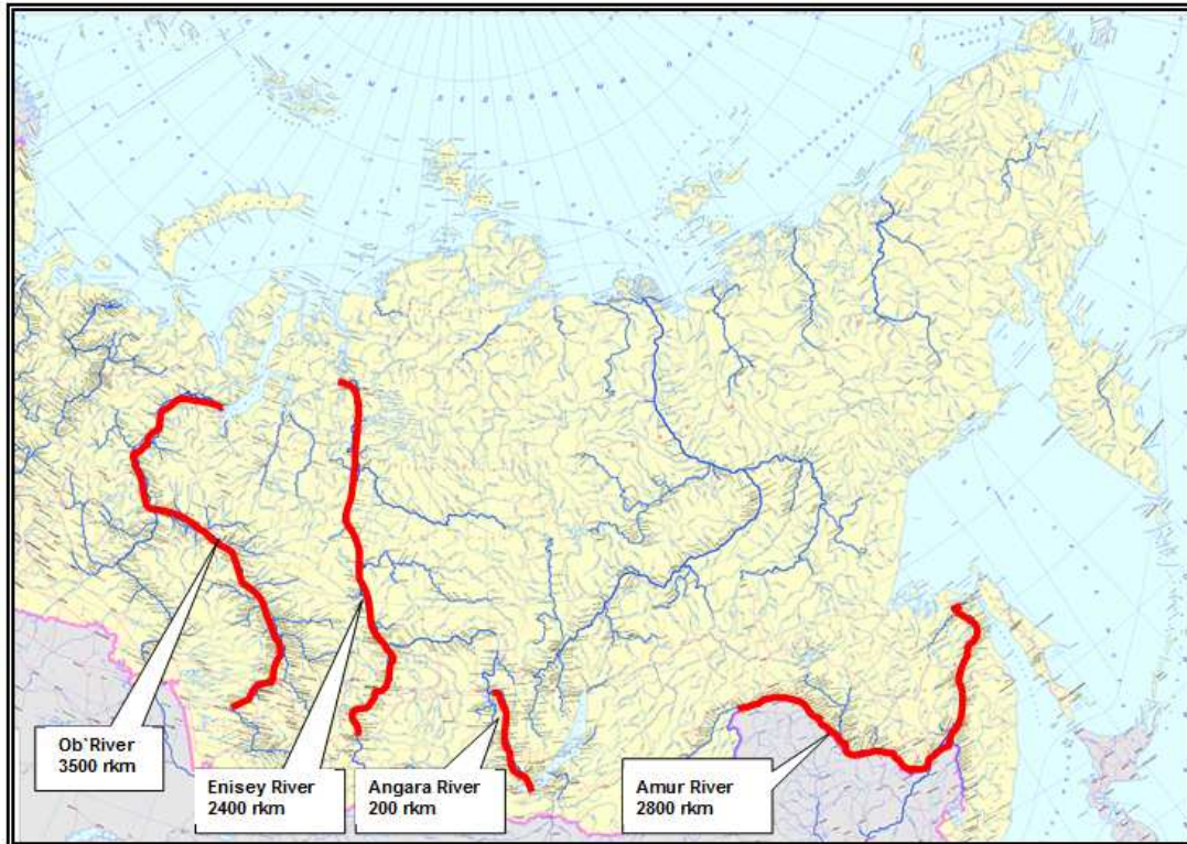
ENC coverage of the Siberia and the Far East part of the Russian IWW – planned for 2009